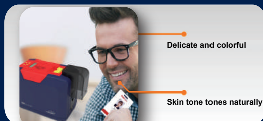
High quality photo processing by Dye sublimation technology

Dual interface card encoding module Contactless ID Card encoding module UHF chip card encoding module Magnetic stripe card encoding module